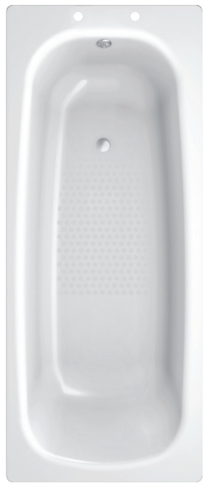
Bath shown with anti-slip